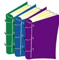
WHO IS JESUS?

The following is a brief synopsis of “Who is Jesus?”