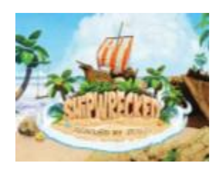
VBS ~ July 15-19 ~ 5:30-8:00pm

At Shipwrecked VBS, kids discover how Jesus rescues us through life's storms. Shipwrecked is filled with incredible Bible-learning experiences kids see, hear, touch, and even taste! Sciency-Fun Gizmos™, team-building games, cool Bible songs, and tasty treats are just a few of the standout activities that help faith flow into real life. Plus, we'll help kids discover how to see evidence of God in everyday life—something we call God Sightings. Get ready to hear that phrase a lot! We begin each evening at 5:30pm with a kid-friendly meal. Then at 6:00pm, VBS begins! We'd love to have you come all week; but if you're only available a couple nights, we still want you to join us. The cost is $10 per child or $20 per family which includes dinner each night. We also have scholarships for families who want to attend VBS but cannot afford the cost. Our Kick-Off Dinner is at 5:30pm on July 15<sup>th</sup>. We hope you can come!